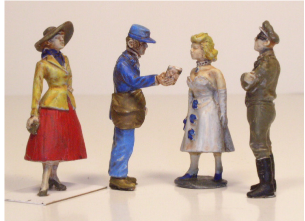
Phoenix figures painted by Granite Creek Enterprises

I hope you find something in these pages that inspires you to build a model or two.