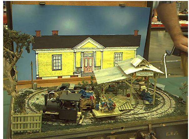
Rick Perry's layout in a briefcase